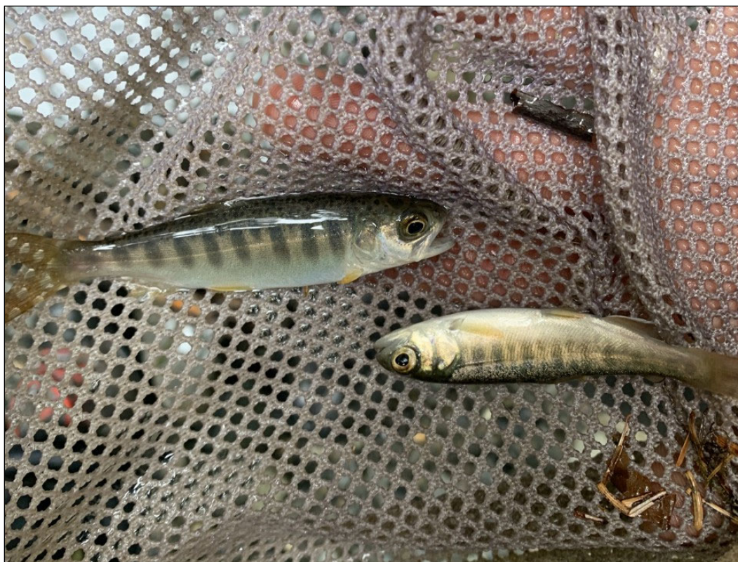
Figure 1.—Juvenile coho salmon captured at waypoint 1785.