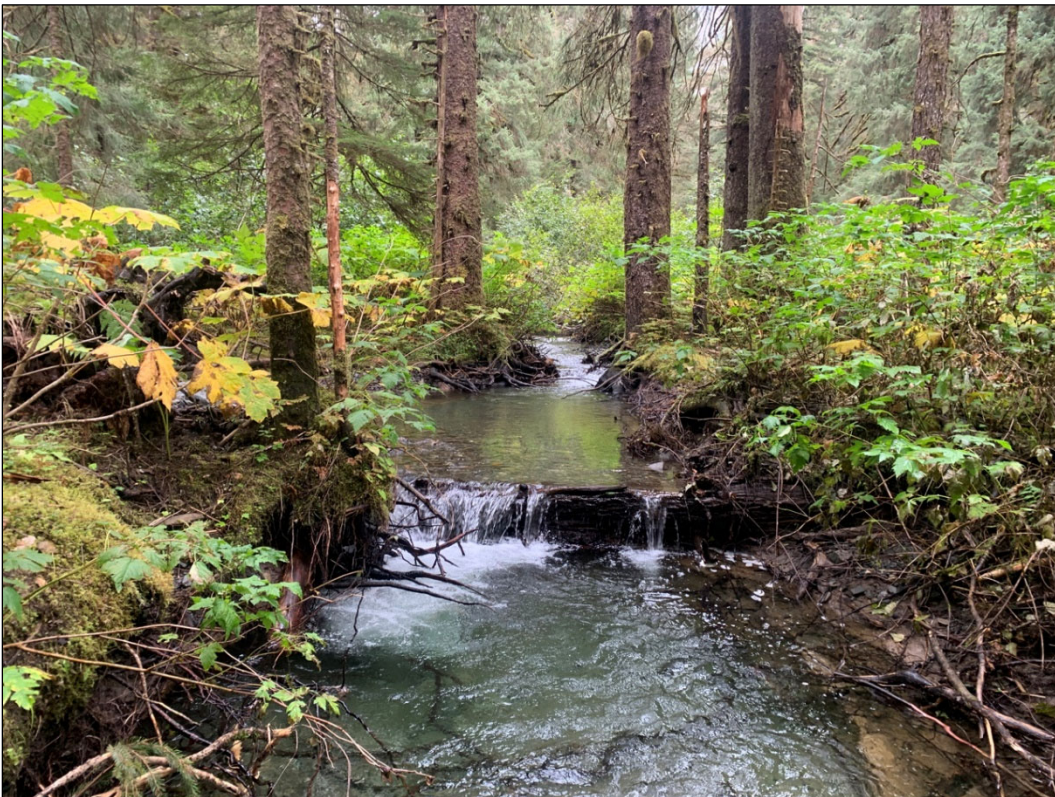
Figure 3.—Channel at waypoint 1786.