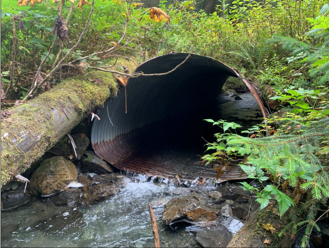
Figure 2.—Culvert outlet at waypoint 1785.